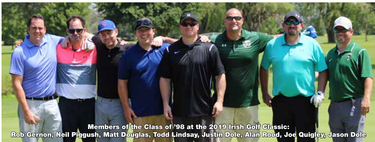
Members of the Class of '98 at the 2019 Irish Golf Classic: